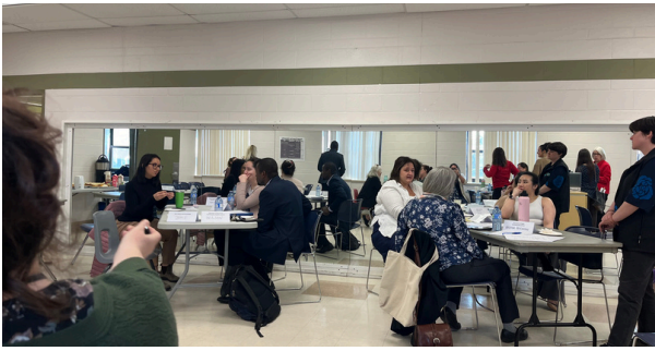
April 2025 SPSCCC Meeting #7 at Sir Winston Churchill Recreation Center