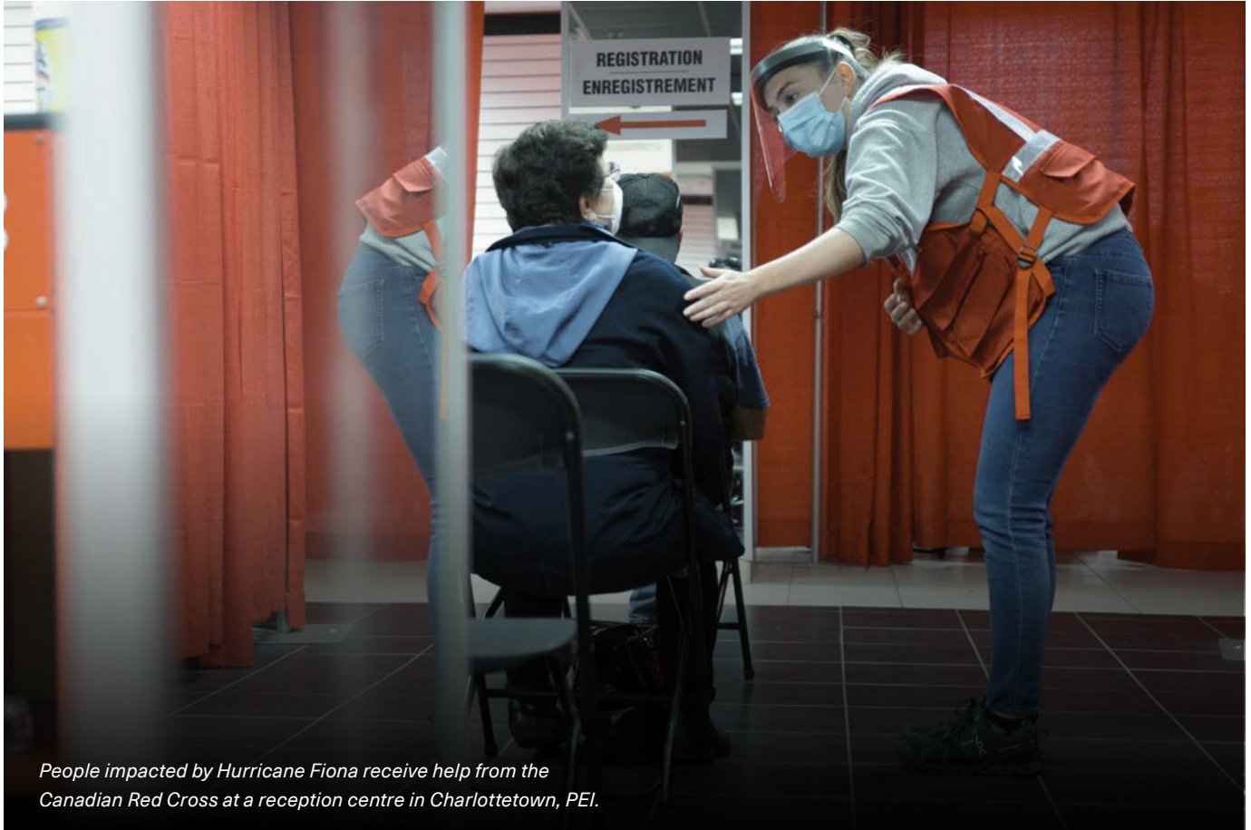
People impacted by Hurricane Fiona receive help from the Canadian Red Cross at a reception centre in Charlottetown, PEI.

Thanks to our generous donors, community organizations, businesses, and government partners, as of December 31, 2022, the Hurricane Fiona in Canada Appeal has raised over $31 million, not including matching funds from the Government of Canada. To date, all appeal funds have been fully allocated.