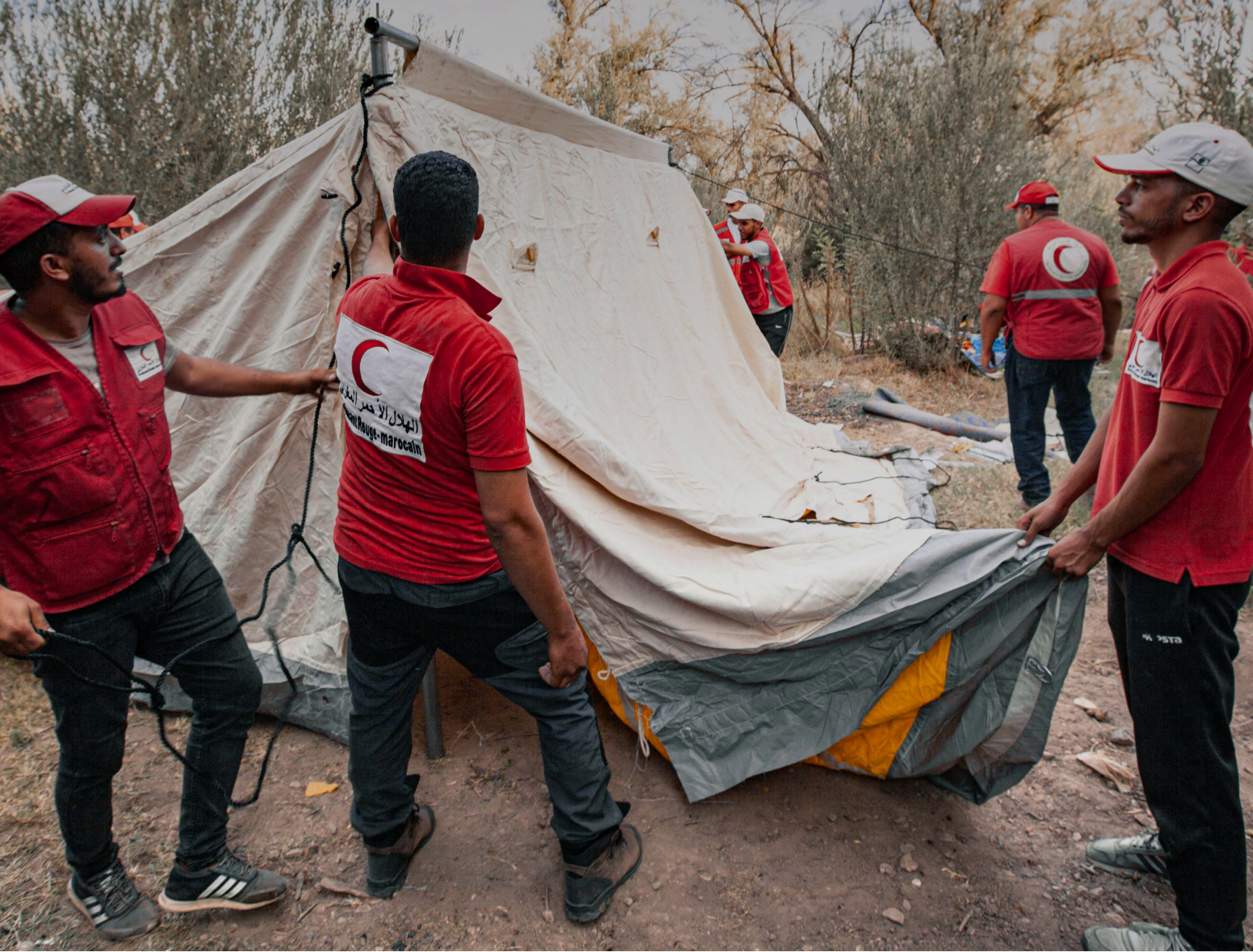
Benoit Carpentier / IFRC