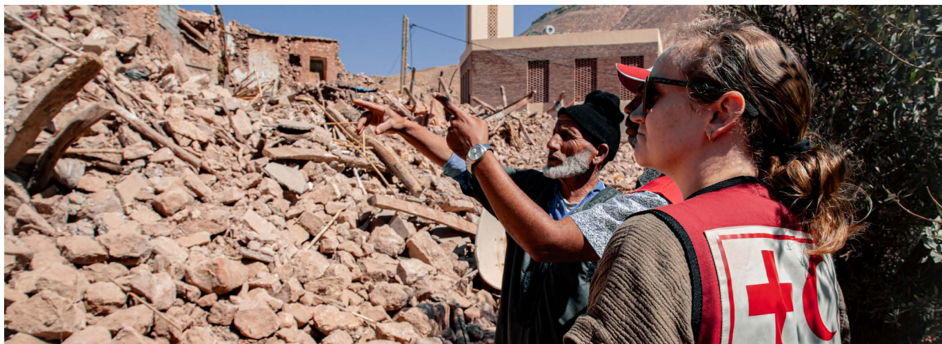
Benoit Carpenter / IFRC