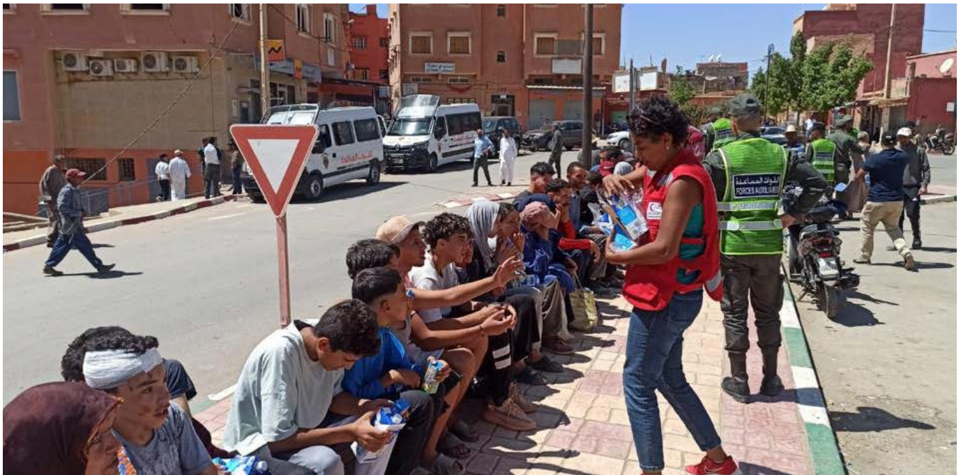
Moroccan Red Crescent

Since the earthquake families continue to struggle with the aftermath. Many continue to live in overcrowded tents with limited privacy where they are exposed to harsh elements like wind and snow during the winter months along with heat in the summer months. Thousands of people are still battling an absence of stable shelter, clean water, and essential sanitation facilities. It will take years for people in Morocco to fully recover.