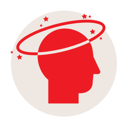
EXTREME DROWSINESS OR UNRESPONSIVENESS