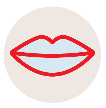
PALE OR BLUE/GREY SKIN OR LIPS